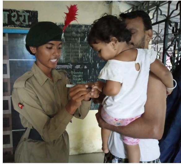
Cadets giving Polio Dose