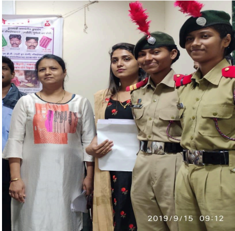
Girl's seniors with Doctor