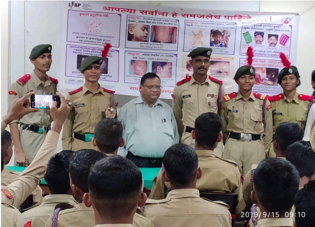
NCC Seniors with Doctor