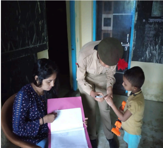
Cadet giving Mark for Polio Dose